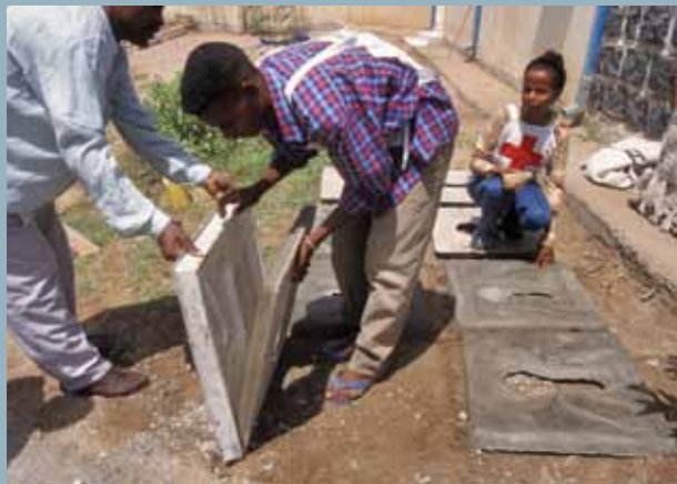
Community volunteers construct permanent squatting plates to improve household latrines and end open defecation.

In Eritrea, there are significant disparities between rural and urban access to adequate water and sanitation. For example, only 54 per cent of the rural population has access to improved water, compared with 72 per cent of urban populations. The figures for sanitation reveal even greater inequities; only three per cent of the rural population has access to sanitation compared with 34 per cent of the urban population. 1