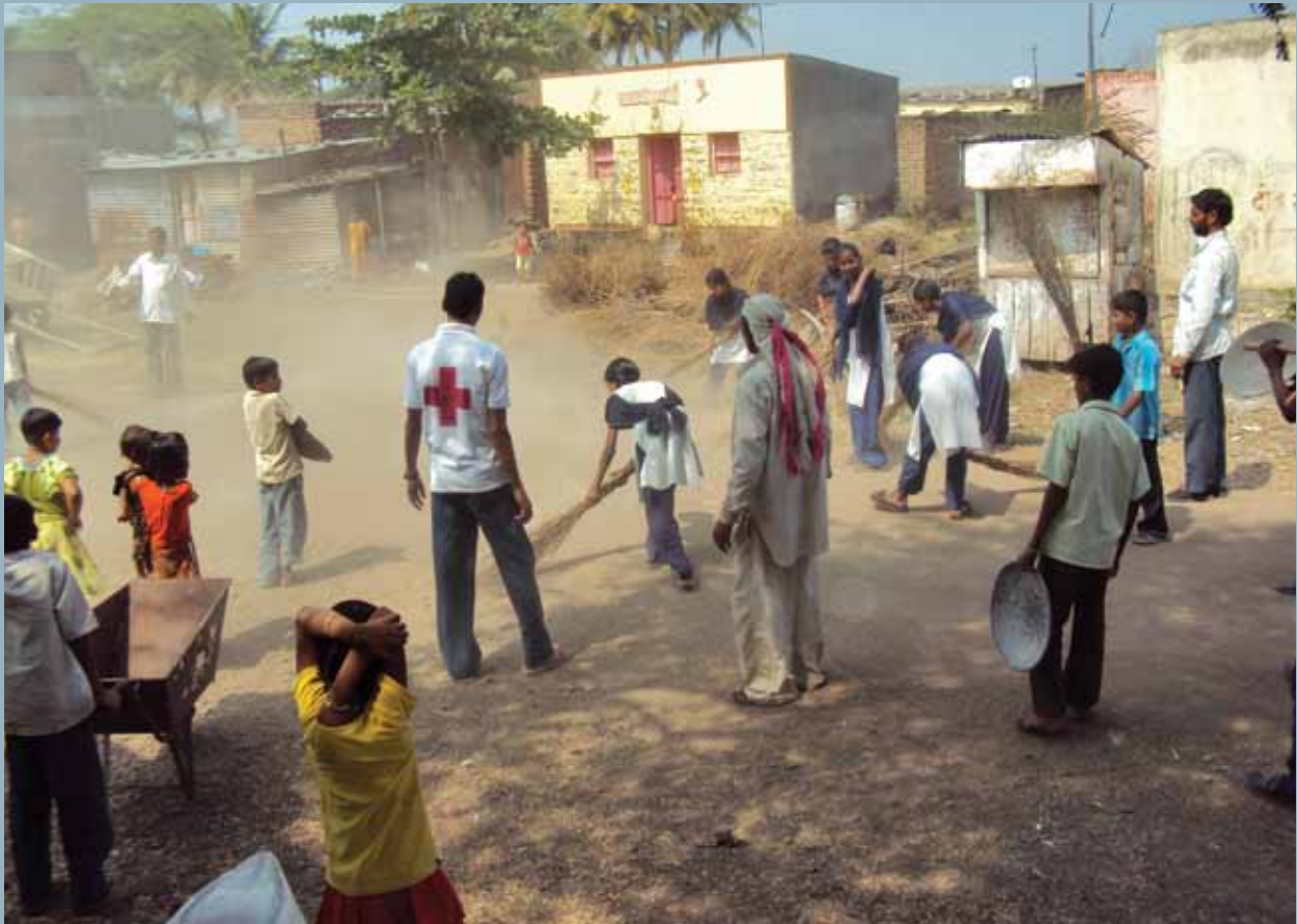
All members of the community are motivated to create their own open defecation free living environment.

In Kasarwadi, a village of 1,400 people, open sewers and open defecation were a way of life. Despite having access to a water supply, sanitation had not been a priority and in recent years, the community has continued to suffer plague, gastroenteritis and chikungunya as a result. The situation they face is identical for a staggering 626 million people across India – 60 per cent of the entire world's population that continue to defecate openly – despite approximately 86 per cent of this number having access to an improved water supply. Communities were not demanding improved sanitation.