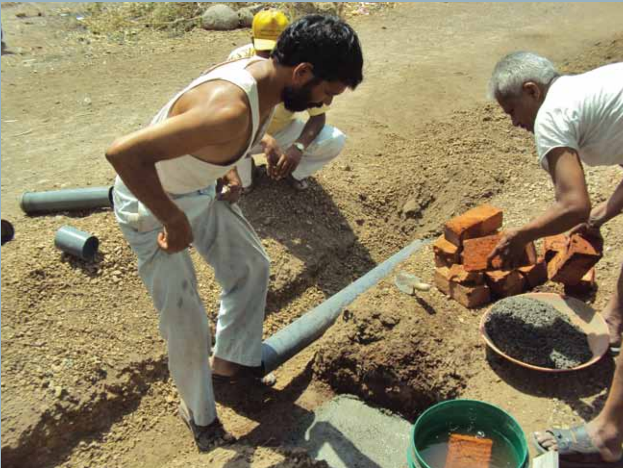
Wastewater management solutions are made permanent by the community after creating demand for sanitation.

In a country with a population of 1.2 billion, where more people own a mobile phone than have access to a toilet, creating demand for sanitation, changing hygiene behaviour, and empowering communities to take both responsibility and action in their own sanitation solutions is a necessity. The Indian Red Cross Society is helping communities help themselves to meet such challenges.