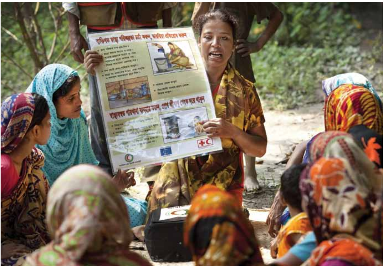
Women are the prime drivers of improvements in household hygiene behaviour and use of latrines; ensuring sanitation is sustainable.

There are many reasons for this, but the construction of a sewerage system in London during the second half of the 19th century is widely credited as one of the most important factors. Originally intended to reduce the odor of the Thames River, the