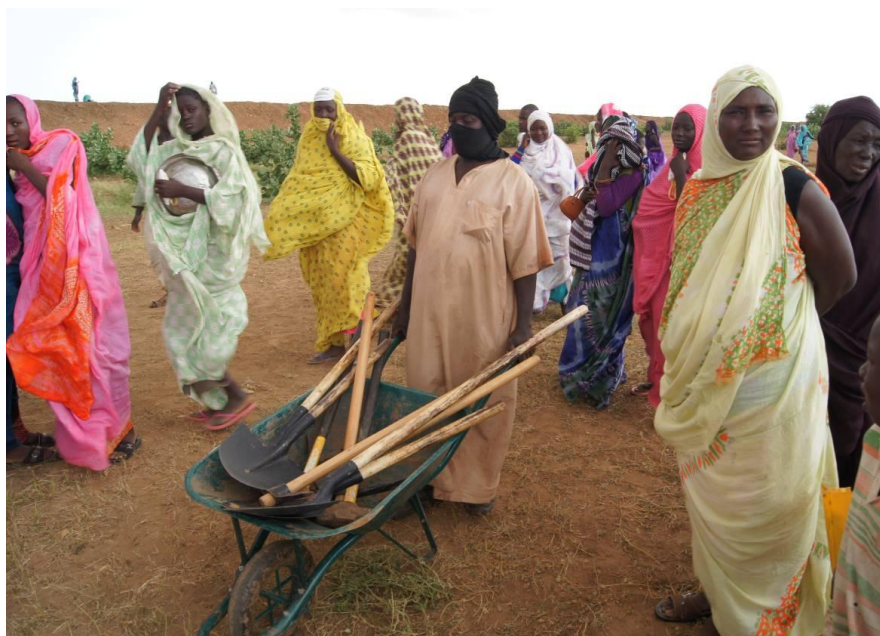
Dikes rehabilitation through cash for work in Maghta Lahjar

<click here to view the interim financial report; here to view the revised emergency appeal budget; or here for the detailed contact information>