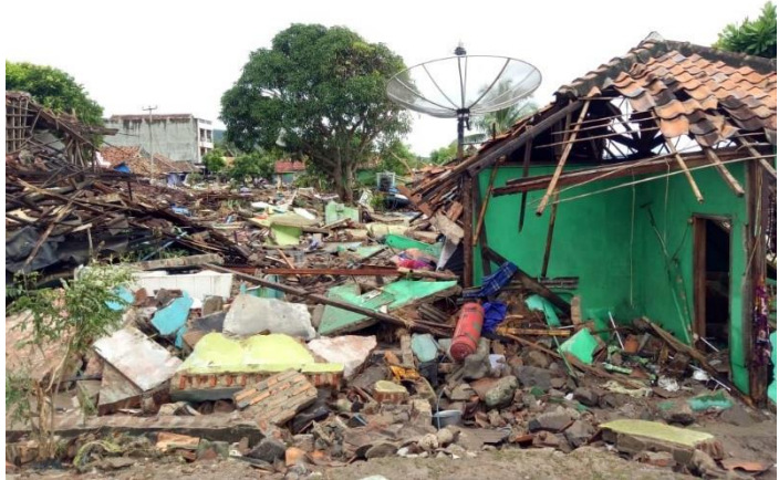
The impact of tsunami/tidal wave in Way Muli, South Lampung.

The initial prediction on the cause could be that of a possible underwater landslide due to the eruption of Mount Anak Krakatau combined with higher than usual tides due to the full moon. The causes of this event are being investigated by BMKG (Agency for Meteorology, Climatology, and Geophysics), BNPB (Indonesian Disaster Management Authority) and PVMBG (Centre of Volcanology and Geological Disaster Mitigation). This Government has issued a warning of no activity along the coastal area.