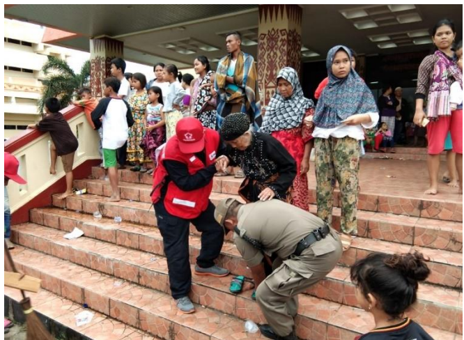
PMI is evacuating affected people in South Lampung.