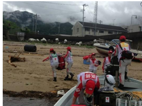
Medical relief team arrives in Sakacho, Hiroshima - one of the worst hit prefectures.

The record heavy rainfall that started on 5 July 2018 in wide areas of western and eastern Japan has been causing serious flooding and landslides in the region. According to the Fire and Disaster Management Agency, evacuation orders were issued to 1.9 million people and advisory notices to 2.3 million people as of 1500hrs on 8 July 2018 local time. The agency also reports that 75 people are dead, 102 people are injured and 28 are missing as of 1530hrs on 8 July 2018 local time. More than 200 houses have been damaged fully or partially by the disaster, in addition to more than 5,000 houses that have been affected by the floods and landslides according to the above-mentioned agency. The destruction of infrastructure is causing outages of water. Rescue and relief activities by the Self-Defense Force, Coast Guard, police and fire departments are underway. Although weather officials have lifted emergency warnings, they are calling for continued caution against floods and landslides.