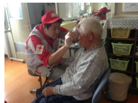
A doctor visits Koyaura Elementary School in Hiroshima which has become an evacuation center.

IFRC Asia Pacific regional office (APRO) in Kuala Lumpur is in constant communication with JRCS and monitoring the situation closely.