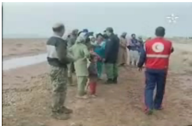
Moroccan RC has been present on the site since the beginning of the disaster in order to support the affected communities

Following the weather forecast and the recent storms affecting the southern Mediterranean, the Moroccan RC has been present in the remote areas and has been intensifying its interventions on the ground in support of affected communities. The National Society has mobilized at an early stage its resources at national, regional and local levels, which allowed the volunteers to already distribute relief items to 1,200 families (distribution of food, blankets, kitchen kits, and clothing). Given the large number affected and rendered homeless, Moroccan RC has not only supported the affected population in the early stages of the emergency, but also plans to continue that support during the rehabilitation phase, with an ongoing distribution of relief items and support to first aid and the provision of clean water. Moroccan RC mobilized over 220 volunteers and professionals at a local level, to conduct needs assessment, deliver and distribute assistance to beneficiaries and will