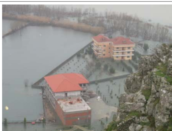
Flooded areas in the north-western part of Albania.

Summary: Due to the rainfall in recent days, accompanied with the melting of snow in the northern area of Albania, the Drini river flows have been increasing, which has consequently increased the water levels in three hydroelectric power lakes. The authorities were obliged to release water from the lakes, which, together with heavy rainfalls, caused flooding in the prefectures of Shkodra and Lezha affecting more than 2,200 families. Some 3,572 persons have been evacuated.