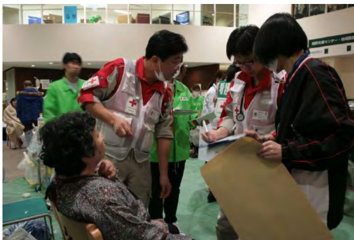
Japanese Red Cross Society staff and volunteers responded to the disaster within hours and continue to provide relief and health and care to affected communities.

Ten days into the disaster, Japanese Red Cross continues to provide emergency relief, medical services and psychosocial support to affected communities. As of 21 March, a total of 249 medical missions involving more than 735 persons were deployed to the affected prefectures, with over 125,000 blankets and 20,700 emergency relief packs distributed at time of reporting. A website supporting restoring family links in five languages was also launched, with over 5,100 registrations to date.