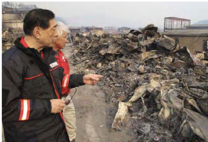
The president and programme coordination director of Japanese Red Cross Society visited Iwate prefecture on 13 March 2011.

The President of JRCS has visited the worst affected areas in Iwate prefecture with the assessment team on 13 March 2011, and confirmed the severity of the disaster at the scene.