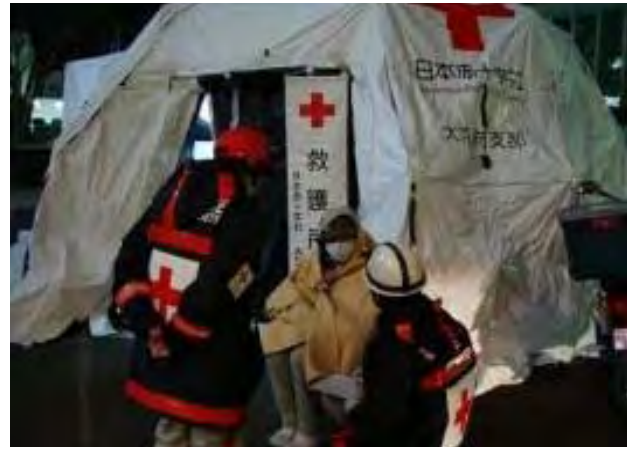
Japanese Red Cross Society emergency response units support affected communities with medical services.

In addition to the physical impact of the disasters to the affected population, JRCS recognises that the multiple disasters, compounded by the threats of the nuclear incidents in Fukushima, have a strong psychological impact especially among children. JRCS has assigned a trained psychosocial support (PS) provider in each deployed medical team – where the national society has 2,369 nurses who are trained and ready to provide PS services. In addition, some PS teams were deployed to conduct assessments in the affected areas, and to undertake PS activities involving those affected by the earthquake and tsunami. The PS teams are also supporting medical teams in doing health check services, such as taking blood pressure of people in evacuation centres.