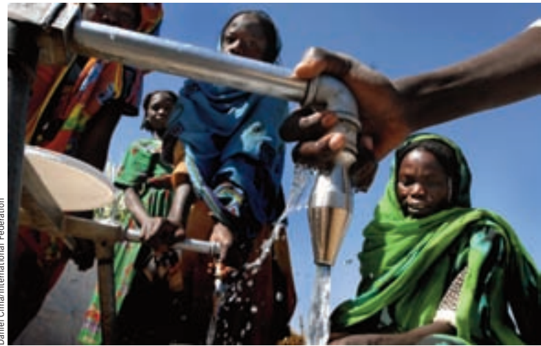
Daniel Cima/International Federation

There are three water and sanitation modules available according to water volume required, hygiene require-