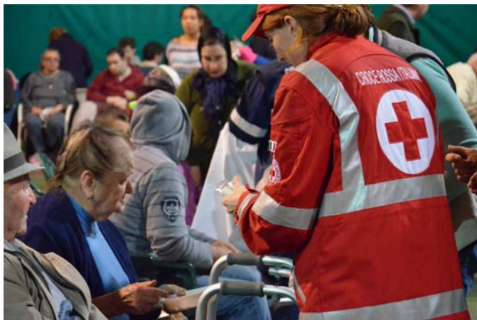
Assistance in the collective Centre.

The Italian Red Cross responded immediately after the earthquake, activating the National Operations Room in Legnano (Milan), which is coordinating the operations, and the Regional Operations Room in Emilia Romagna, and the Provincial Rooms. Already in the early hours of dawn, the Red Cross branches in Ferrara, Modena, Reggio Emilia and Bologna were mobilized, with some 211 volunteers at work, 32 vehicles (25 ambulances and 6 vehicles for the transportation of materials to the site), and 12 inflatable tents that are sheltering affected people.