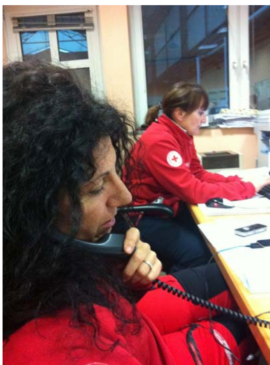
The Italian Red Cross National Operations Room in Legnano (Milan), is constantly monitoring the situation in the affected regions.

Summary: A magnitude-5.9 earthquake struck north-eastern Italy on Sunday 20 th May, early in the morning, killing at least seven people, injuring 50 and toppling several buildings. The quake struck at 4:04 am between Modena and Mantua, about 35 kilometres north-northwest of Bologna at a relatively shallow depth of five kilometres. The epicentre was between the towns of Finale Emilia, San Felice sul Panaro and Sermide, but was felt as far away as Tuscany and northern Alto Adige. According to seismologists, it was one of the strongest quakes to shake the region. The initial quake was followed by a 5.1-magnitude aftershock an hour later. Until the end of the day 75 aftershocks were registered.