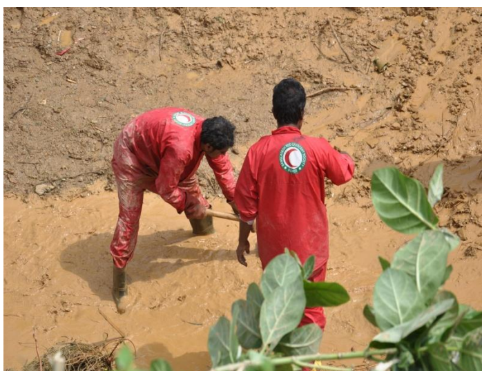
BDRCS volunteers in search and rescue operation in Chittagong mud slide on 27 June 2012.

Summary: Monsoon rains starting 25 June 2012 in southeast and northeast Bangladesh resulted in flash floods and landslides causing at least 110 deaths. Damages have been most severe in the southeast Chittagong, Cox's Bazar, and Bandarban districts and in northeast Sylhet district. Landslides, house collapses, drowning and lightning following torrential rains on 27 June caused further damages and loss of lives in Cox's Bazar, Chittagong, Bandarban and Sylhet.