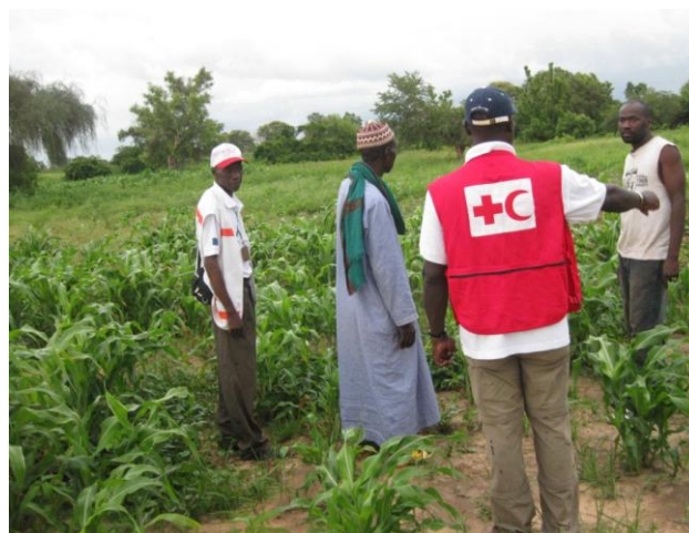
Crop inspection following the emergency seed donation in Diema in September 2012.