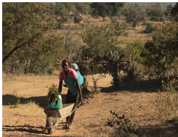
The drought situation has increased the burden of accessing safe water: Photo / Zimbabwe RC

Identification of food item suppliers is in progress with the town of Kwekwe (100 km North East of Nkayi) being the preferred source due to accessibility and good road condition. An alternative supply from Bulawayo (150 Km South of Nkayi) is also being considered.