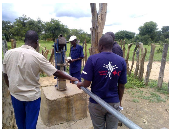
ZRCs and DDF staff assessing boreholes in Nkayi