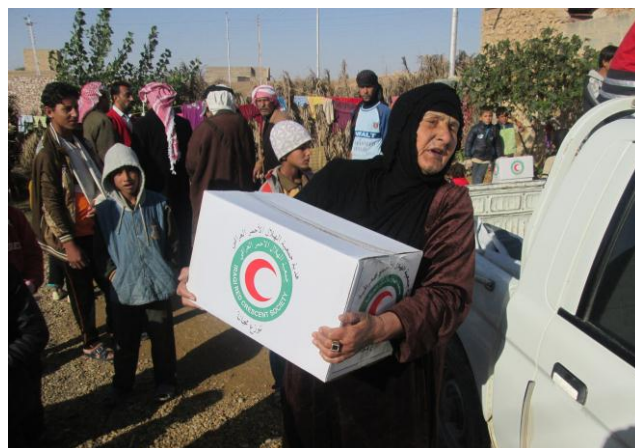
A displaced woman receives relief items from IRCS.

Iraqi Red Crescent has responded to the situation and has provided relief and food items to the displaced as well as people inside the city.