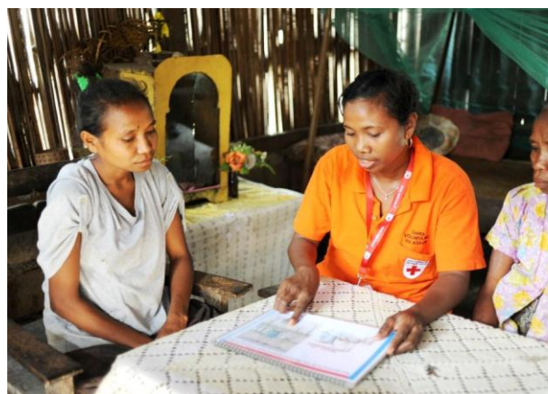
Cruz Vermelha de Timor-Leste (CVTL) volunteers conduct house-to-house visits and share knowledge on dengue prevention.

In response to the government's request, Cruz Vermelha de Timor-Leste (CVTL) has mobilized 28 trained volunteers in two target areas in Dili. The volunteers have started to visit households and disseminate information related to dengue fever and its prevention. The proposed MoH campaign will include environmental cleaning in target areas. CVTL plans to strengthen the capacity of the volunteers by providing refresher training on dengue knowledge and behaviour change communication skills. In relation with awareness campaigns, CVTL will distribute brochures, erect banners with appropriate health messages in strategic locations and further disseminate key messages to target groups and the general public through the use of local radio.