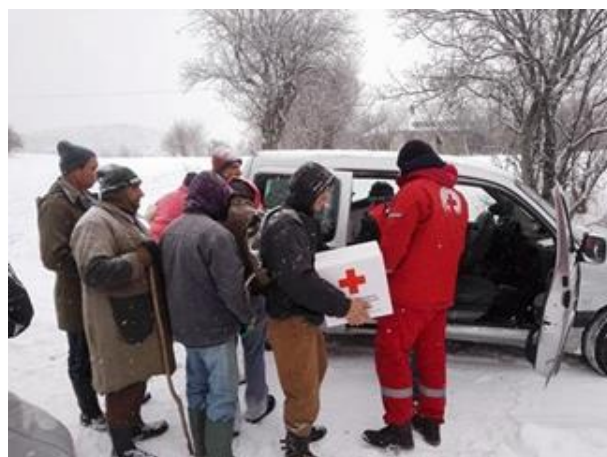
Volunteers from the former Yugoslav Republic of Macedonia providing relief items to the affected people.

National Societies across Europe are working to provide warm clothes, hot food, blankets and first aid to people affected by the severe cold weather. In Greece and the Balkans, teams are assisting both the local population (homeless, vulnerable people, stranded motorists) and asylum seekers and refugees who have already endured months in harsh conditions.