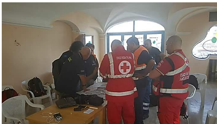
Italian RC volunteers coordination with local authorities.

The municipalities of Casamicciola Terme and Lacco Ameno suffered the greatest damages as the seismic waves were amplified at these parts of the island. Several buildings collapsed or got destroyed as a consequence of the earthquake.