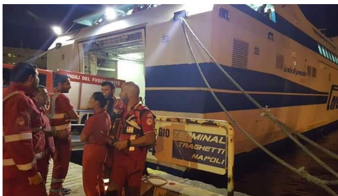
Italian RC volunteers present in the ports.

In total, 40 volunteers were actively involved in the operation.