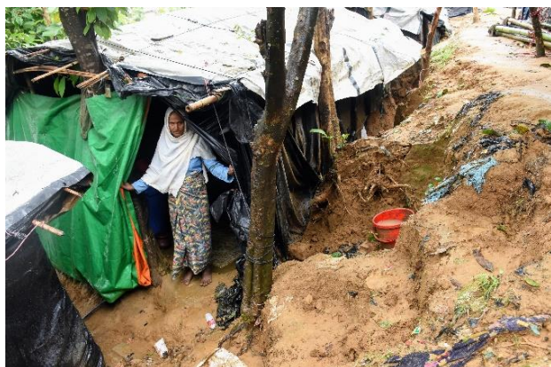
Monsoons rains caused landslides in camps in Cox's Bazar.

Heavy monsoon rains have been affecting some parts of Bangladesh since 9 June 2018. More than 20 people have lost their lives and hundreds of thousands of people are affected in south-eastern part of Bangladesh including Cox's Bazar, Rangamati, Khagrachhari, Bandorban, Chattagram districts, as well as eastern part of the country including Moulvibazar and Sylhet districts.