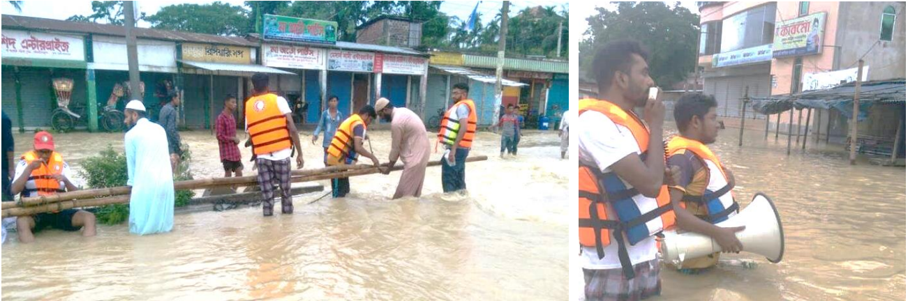
BDRCS volunteers evacuating flood affected people in Moulvibazar district.

In view of the flooding situation in eastern part of Bangladesh, more than 50 volunteers from the Moulvibazar Red Crescent unit have been working along with search and rescue team of the local government. Besides, one National Disaster Water Response Team (NDWRT) member and one WASH technical team consists of BDRCS and IFRC staff have been deployed from NHQ to Moulvibazar district along with two water purification units.