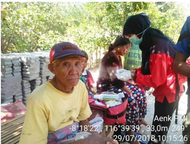
PMI medical team is providing health services to the affected people

PMI has been on the ground from the onset, with its base units mobilizing 35 volunteers, including the members of community-based volunteers to support search, rescue and retrieval efforts, delivery of immediate assistance and undertake rapid assessments. To enable its base unit in Lombok to deliver immediate assistance to the affected people, PMI is preparing to dispatch relief supplies of 250 family kits, 250 hygiene kits, 500 tarpaulins, 100 body bags and 250 blankets for 250 families from its regional warehouses in Gresik and Serang. The National Society is also mobilizing three ambulances (with medical crew), as well as two operational vehicles (for evacuation) from its base units in Lombok.