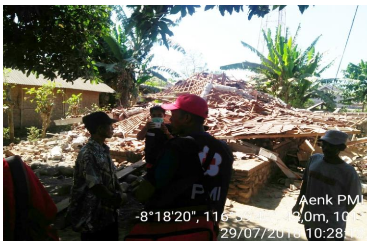
PMI volunteers are undertaking assessment after the event struck Lombok District, West Nusa Tenggara Province.

A 6.4 magnitude earthquake has struck off Lombok, province of West Nusa Tenggara, Indonesia, at 05:47h local time, on Sunday 29 July 2018, followed by 66 aftershocks with the highest magnitude of 5.7 (data released by BMKG at 10.20h local time). The earthquake affected the three districts of North Lombok, East Lombok and West Lombok, with ten casualties reported to date and dozens others injured, damaging many buildings and homes (assessment is underway and fixed figures to be shared soon). According to the US Geological Survey (USGS), the quake was centred 50 kilometres northeast of the city Mataram on the northern part of Lombok island, with a depth of 10 km. Indonesia's agency for meteorology climatology and geophysics (BMKG) indicated that there was no risk of a tsunami. The quake also impacted Mount Rinjani national park, a popular trekking destination. Access to the climbing routes are temporarily closed due to reports of a landslide around the mountain.