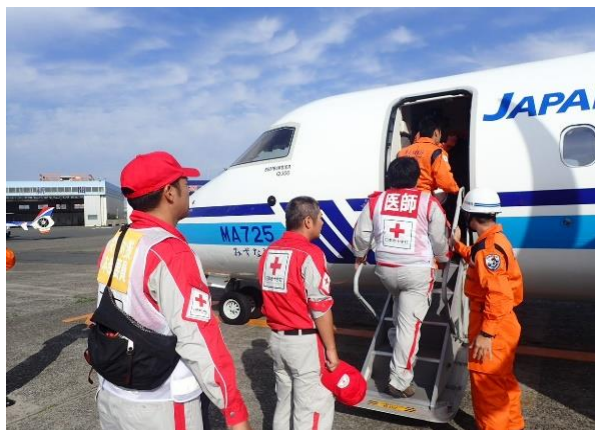
Coordination and assessment team leaving to reach the affected area.

IFRC Asia Pacific Regional Office (APRO) in Kuala Lumpur is in constant communication with JRCS and monitoring the situation closely. APRO is on standby to provide any assistance if required.