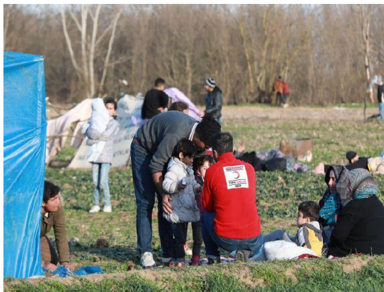
Pazarkule Border Gate, Edirne, Turkey, 3 March 2020 Migrants wait to cross into Greece at the Pazarkule border gate near the Turkish border town of Edirne.

Turkish Red Crescent (TRC) Migration Services Department and local branches mobilized an assessment team to the area. Mobile emergency response teams are distributing relief items such as winter clothes and blankets and providing internet hotspots and charging units on the border to help migrants connect with their family members. Two mobile catering units are serving hot soup, water and biscuits at the border gates of Pazarkule, and Ipsala in Edirne, as well as Çanakkale's Ayvacık province. Delivery of humanitarian assistance items is being made by land vehicles from TRC warehouses and offices temporarily allocated to the National Society by the Turkish government authorities. Neighbouring regional TRC Disaster Management Directorates are also supporting the provision of urgent relief items (including clothes, shoes, socks, baby diapers, hot food and beverages.) These items will be stocked in a nearby warehouse allocated by the Turkish government's State Hydraulic Works (DSI) and prepared for distribution.