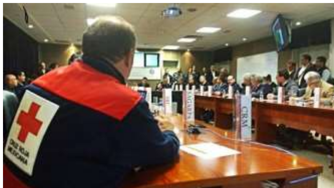
The Mexican Red Cross participated in a coordination meeting with the president of Mexico.

According to the British Broadcasting Corporation (BBC), an 8.1-magnitude earthquake on the Richter Scale struck off the Pacific Coast of Mexico--around 87km (54 miles) south-west of Pijijapan--at 23:50 local time on Thursday, 7 September 2017 (04:50 Greenwich Mean Time [GMT] Friday). A tsunami warning was issued for Mexico, Guatemala, El Salvador, Nicaragua, Costa Rica, Panama and Honduras; however, it was later lifted. An estimated 50 million Mexicans felt the tremor per the Mexican government.