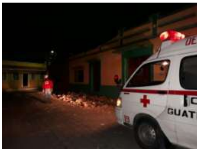
Guatemalan Red Cross volunteers conduct a damage assessment following the quake.