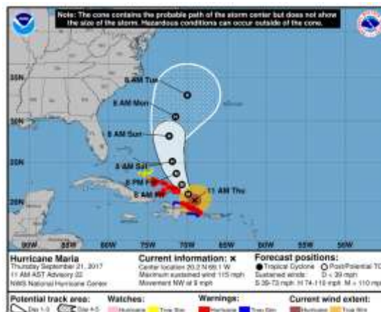
Hurricane Maria's path and predicted trajectory as of 11 am on 21 September 2017.

Hurricane Maria's large eye was 105 miles (175 KM) east-northeast of Puerto Plata, Dominican Republic and 155 miles (255 KM) south-east of Turks and Caicos' Grand Turk Island, near latitude 20.2 North, longitude 69.1 West at 1100 AM Atlantic Standard Time (AST) (1500 Coordinated Universal Time [UTC]). Maria is moving toward the north-west at around 9 mph (15 km/h), and this general motion is expected to continue through tonight. A turn toward the north-northwest is forecast early Friday, 22 September 2017, with that motion continuing through early Saturday, 23 September 2017. On the forecast track, Maria's eye will continue to pass offshore of the Dominican Republic's northern coast today, 21 September 2017 and then move near or just east of the Turks and Caicos Islands and south-eastern Bahamas tonight and on Friday. Maximum sustained winds remain near 115 mph (185 km/h), with higher gusts; Maria is a category 3 hurricane on the Saffir-Simpson Hurricane Wind Scale, and some strengthening is possible in the next day or so 1 .