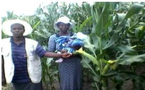
Beneficiaries in maize farm from Bindura, project funded by the Japanese Government

The food Security component was funded by WFP and the Japanese government. The support enabled the NS to reach 103% of its target. The NS target for 2012 was to reach 857 and has reached 887 clients who are on ART, TB, malnourished children and lactating mothers and a total of 4,087 beneficiaries with food under the WFP. This programme made an impact in terms of assisting clients to improve their nutritional status e.g. 49% of the targeted clients improved in their Body Mass Index (BMI) status and were consequently weaned from the programme.