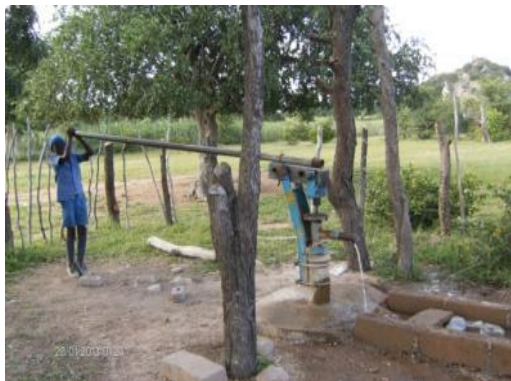
Borehole rehabilitated in Matobo District

The main Objective of this component is to improve the health and quality of life of the vulnerable communities through increased access to safe and sustainable community managed water and sanitation and hygiene promotion. A total of 25,000 beneficiaries were reached through the provision of safe water, 2,380 pupils with sanitation facilities and 45,000 with health and hygiene education messages.