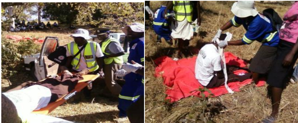
Trainings in Disaster Risk Reduction

Community Based Disaster Risk Reduction (CBDRR) funded by the American Red Cross (ARC) under the Building Resilient African Communities (BRACES) projects is complimenting funding to the Zambezi River Basin initiative. The project targeted at training and building communities resilience. The training and the knowledge obtained strengthened the community as they embarked on community projects such as training in the use of Rocket Lorena efficient cooking stove. Four (4) initial cooking stoves were built out of an annual target of 50 as test examples and tested to be working very well.