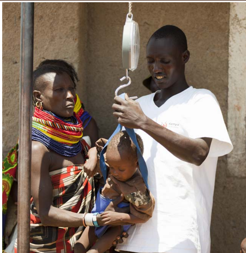
Child growth monitoring in Turkana

This report covers the period 1 January 2012 to 30 June 2012.