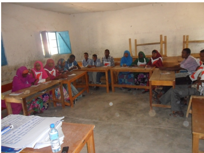
SRCS volunteers attending peer education session at Sheikh clinic, Somaliland

To strengthen the managerial capacity and deliver on its objectives, SRCS focussed on branch development, volunteer and youth management, finance development and governance support. Thirty (30) SRCS staff comprising finance officers, branch secretaries, health officers and disaster management officers from Puntland and Somaliland as well as senior staff from the two SRCS Coordination Offices in Hargeisa, Somaliland and Mogadishu attended a six day training workshop on financial management to update and enhance their financial management and reporting to improve accountability.