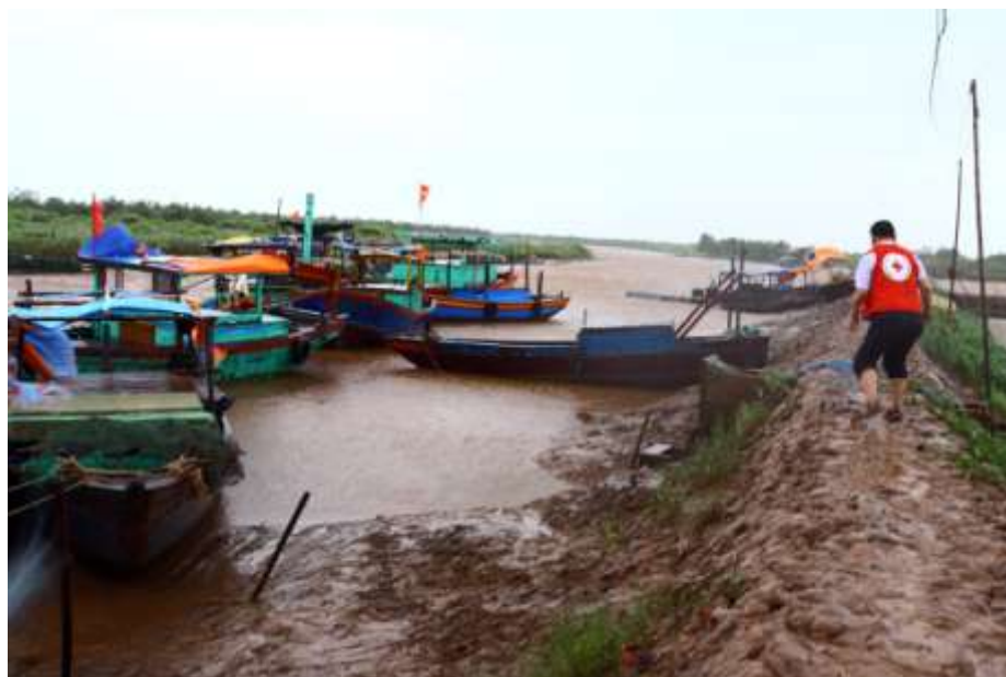
Mangroves provide protection to boats during Typhoon Son-Tinh

Output 3.1 Selected number of urban and rural communities improves their resilience to disasters and adapts to climate change impacts.