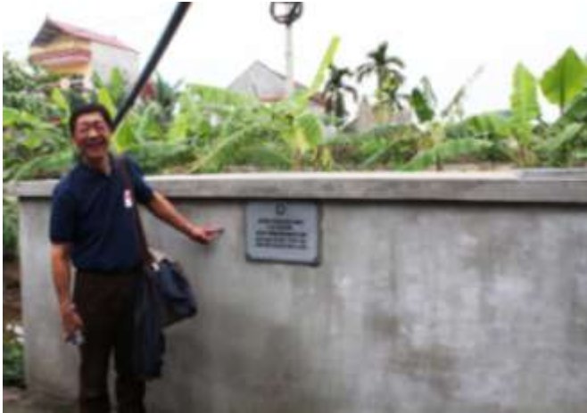
Japanese Red Cross Society (JRCS) staff make a visit to a kindergarten in Kim Hai commune, Ninh Binh to see the condition of a water tank sponsored by the JRCS.

Following VCAs, 35 small-scale disaster/climate change mitigation measures were proposed and completed in 34 communes. 5 These measures focus on constructing and improving water and sanitation systems, inter-village rural and evacuation roads, rural and farming bridges, evacuation boats, early warning/daily communication networks, and commune health stations. Voluntary contributions in cash, labour and other means by local authorities and community members were indispensable to the success of these measures.