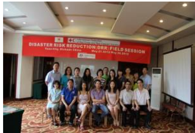
Participants and the facilitator in the regional disaster risk reduction field school in May 2012.

The disaster risk reduction (DRR) field session is a mutual learning process between participants and community people and a good opportunity for Red Cross staff to systematically study and practice the VCA tools and to build up their network.