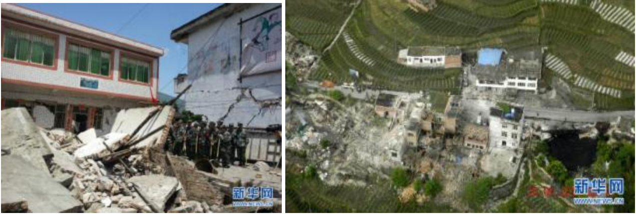
Collapsed structures in the affected area.

Lushan county, a mountainous rural-area, is about 140 kilometers from Chengdu, the capital of Sichuan province and has a population of around 120,000. It was also badly hit during the 2008 Sichuan earthquake. Yaan city, a city with a population of 1.2 million is around 120 kilometers from Chengdu. The hardest-hit areas are in the townships of Longmen, Baosheng and Taiping of Lushan county. It is also reported that Longxiang township and Shuangshi township in Lushan county (both are located in Northern part of the county centre) are likely to be severely damaged. However, rescue teams are struggling to reach there as the roads are damaged.