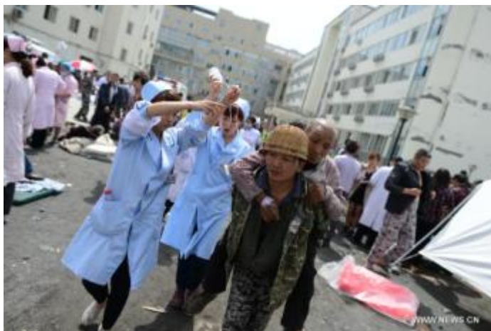
A health care team is providing medical treatment to injured people.

A 7.0-magnitude earthquake hit Lushan county of Ya'an city in south China's Sichuan province at 8:02 a.m. Beijing time on 20 April. The earthquake's epicentre was monitored near Lushan county (30.3 degrees north latitude and 103.0 degrees east longitude) at a depth of 13 kms. Up to 29 aftershocks have been reported, with the biggest one at magnitude 5.3. As of the reporting time, at least 100 people were killed and more than 2,000 injured. Around 120,000 people are reported to be evacuated and relocated in Lushan county.