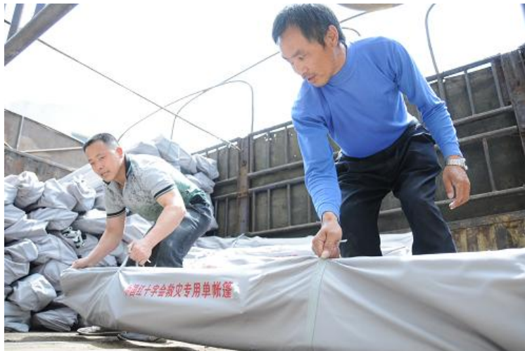
Staff of disaster response warehouse of Nanchong Prefectural Red Cross Branch in Sichuan carry the tents to support earthquake-affected area.

RCSC will work closely with the government in the area of shelter, relief and health.