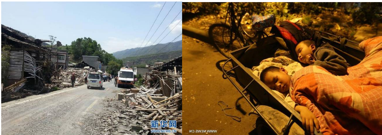
Houses collapsed in quake-hit areas; Source: Xinhuanet The first night after the deadly earthquake; Source: People's Daily

Since the first information bulletin, details of further devastation and damage from the 20 April 7.0 magnitude earthquake in Sichuan are now becoming clear. The earthquake that hit at 8.02 p.m. Beijing time on 20 April, had its epicentre near Lushan county (30.3 degrees north latitude and 103.0 degrees east longitude) at a depth of 13 km. A large number of aftershocks continue to shake the affected area with several of them being above magnitude 5.