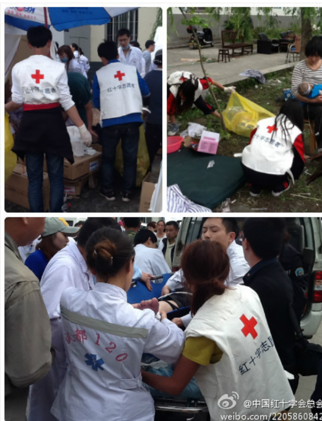
Red Cross volunteers providing medical care to injured people

The International Federation of Red Cross and Red Crescent Societies' (IFRC) East Asia regional delegation and Asia Pacific zone office are in close contact with RCSC to keep updated about the latest situation. Two staff members, including a disaster response coordinator from the zone office, are in Lushan county to assist RCSC teams in conducting needs assessment.