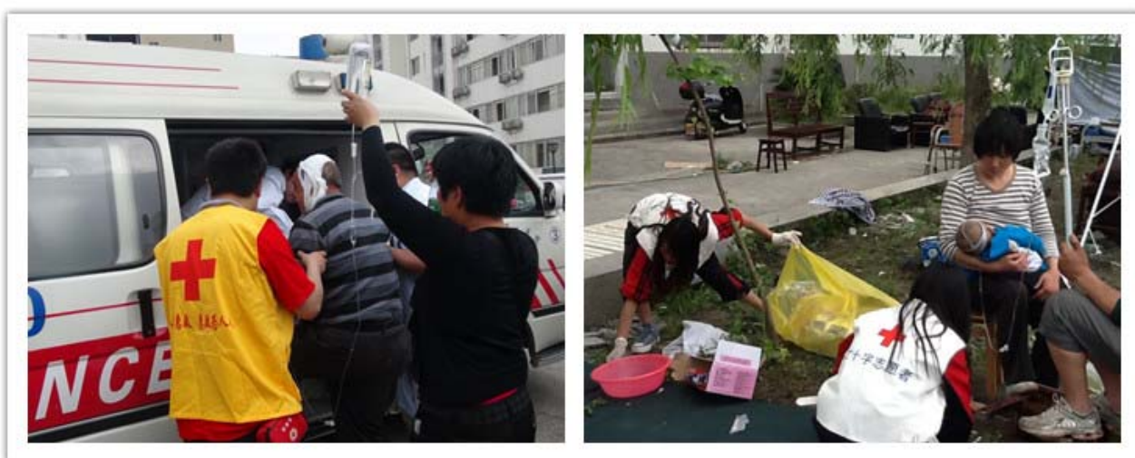
RCSC volunteers helping emergency health response in affected areas.

It is to be noted that various skilled Red Cross personnel have been sent as part of the response team from various RCSC branches. In addition to the health response team of Chongqing provincial branch, RCSC headquarters has sent its specialist 999 Health Relief Team from Beijing. Sichuan provincial branch has dispatched nine response teams for emergency response, health care, emergency telecommunication, search and rescue (Blue Sky Team) and mountain area rescue. Six rescue teams have been sent by Beijing, Shandong, Guangdong, Qinghai and Chongqing branches of RCSC.