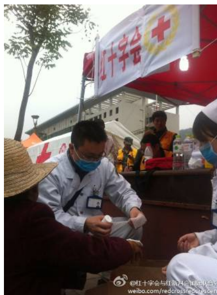
Medical team helping an injured old lady.

Sichuan provincial branch of the RCSC has launched a 24-hour hotline service for disaster-related enquiries. It is important to note that RCSC has activated its 'Restoring Family Links' service to assist the affected families.