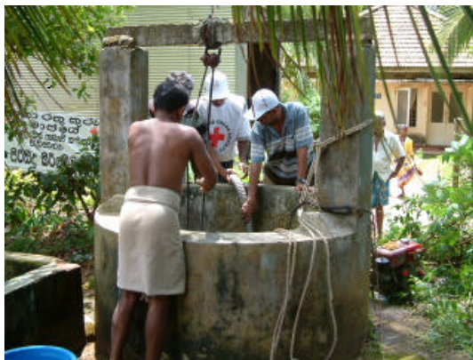
Red Cross volunteers work side by side with a hired professional and the local population in the 23 Red Cross teams that are cleaning flooded wells.