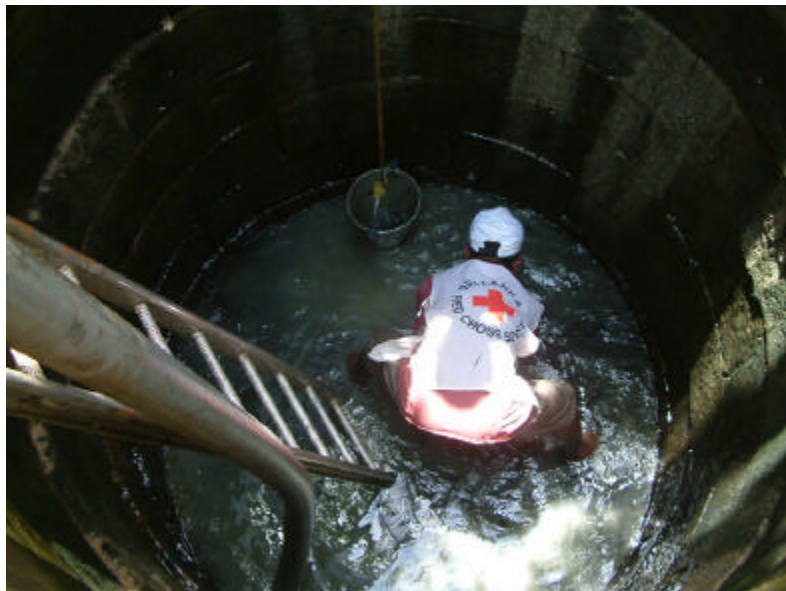
A volunteer cleaning wells in Matara district. Sri Lanka Red Cross quickly started Desilting, chlorination and cleaning of flooded wells.

This Operations Update no. 3 reflects a revised plan of action and budget including CHF 770,584 (EUR 500,000) being sought by the Spanish Red Cross (ECHO funding). This appeal now therefore seeks a total of CHF 2,632,584, and CHF 436,083 is needed.