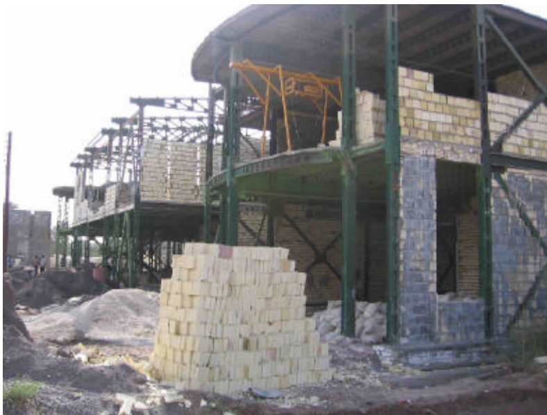
The construction of the Kafi school was accelerated, enabling to move on to the next phase of implementation

Among the five standard schools, the construction of the Kafi, Montazeri and Shamsaddini schools was far behind the schedule at the end of December 2005. Accelerating the construction in these sites was a priority in the first quarter of 2006. The Federation's Bam team and the Shayesteghan Consultancy Company paid very close attention to these sites and actively supported the site managers in setting the proper order of construction works, organizing parallel works and ensuring the advance delivery of construction materials. As a result, a substantial progress has been made in these sites. These sites have now passed the stage of foundation and structural works, the most time-consuming process, and moved on to the next phase of implementation with multiple activities running at the same time.