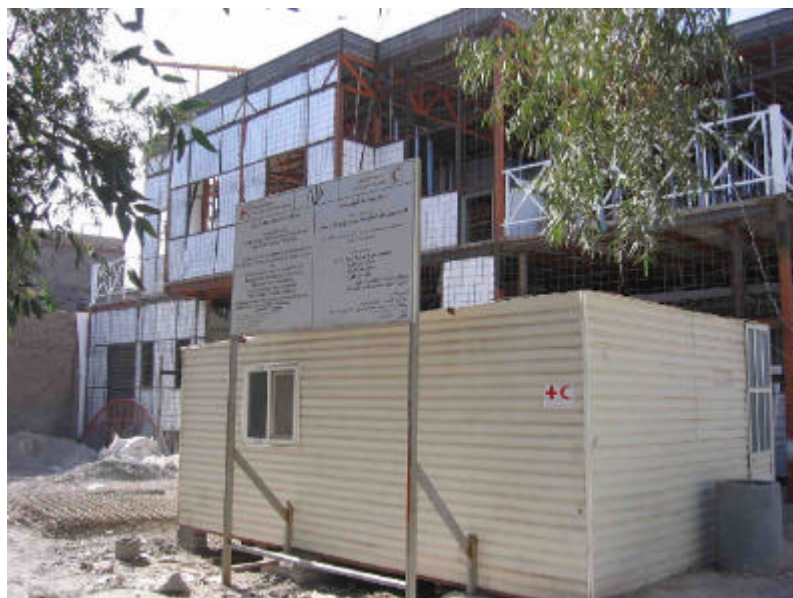
The construction of the Urban Health Centre is in process and is aimed to be finalised on 30 April 2006

The contractor was warned of its failure to meet the deadline of project completion. Meanwhile, the Federation Delegation looked into the problems facing the contractor, advised it on how to address them and held a series of meetings with the local authorities concerned to resolve the problems which are related to themselves.