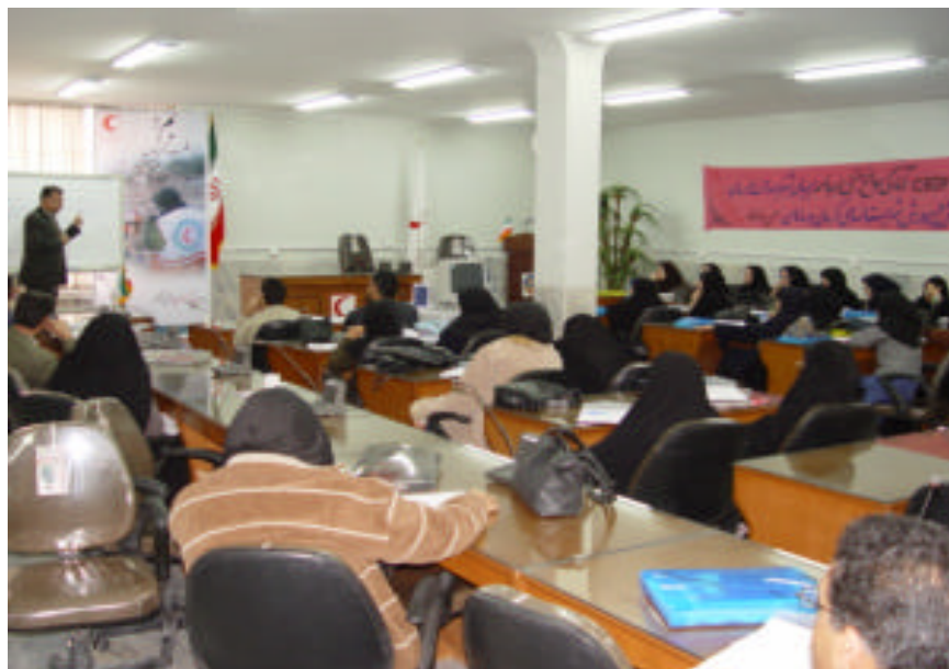
The CBDP project in Kerman, accompanied with training workshops, is aimed at introducing CBDP approaches to local officials, community people and IRCS staff of this disaster prone province

At the end of each workshop, each participant received one training pack including one first aid training book, one book concerning training on disaster preparedness, plus a training CD. The trained participants are expected to give necessary training and apply CBDP practice in their respective communities with the support of IRCS branches.