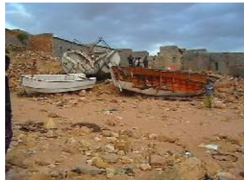
Many fishing boats were also damaged or destroyed along the Somali coast.

The peninsula of Hafun still remains the single site suffering the most profound effects. Access to Hafun is however still hampered by the poor road conditions approaching the town. WFP in particular has reported continued difficulties in transporting food relief there this week, since large trucks traveling from Bosaso are forced to stop at Foar, around 50 km from Hafun. The small 4x4 trucks that continue to shuttle relief to the town are being used by WFP and UNICEF amongst other agencies.