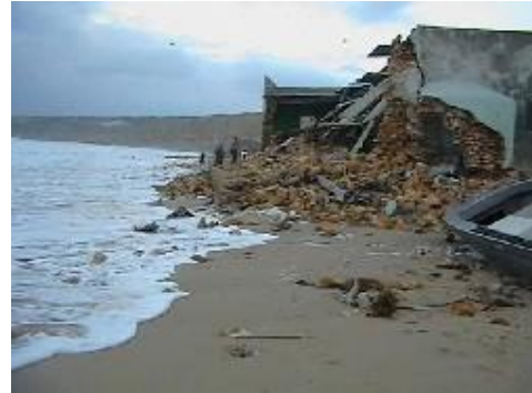
Damaged dwellings along the Somali coast.

UN-OCHA estimates that the tsunami affected about 18,000 households: the appeal uses a working population figure of 54,000 people, an average of 3 people per household instead of the usual average of 6 people. Many of those affected were living in small villages along the coastline, and the numbers of seasonal migrant fishermen have made it particularly difficult to get accurate estimates of population numbers and family size. In addition to the deaths of 150 people, a large number of shelters were either damaged or destroyed, wells were washed away or contaminated with salt water, and a large number of fishing boats and equipment were lost.