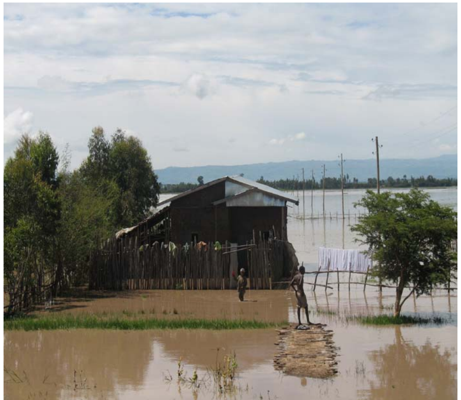
Photo above: flooded land and a house in West Shoa (week of 4-9 September), with a temporary bridge intended to cross the flood waters.

The torrential rains that fell across the Horn of Africa and eastern Africa regions since the beginning of August 2006 have caused extensive flooding in several countries. Rainfall in the Ethiopian and Eritrean highlands resulted in particularly severe flooding in both countries, as well as in Sudan, Uganda, and Burundi. The floods are regional in dimension, and the International Federation has responded to the needs of those affected and the requests of the individual national societies by releasing allocations from its Disaster Relief Emergency Fund (DREF) as well as with the launch of Emergency Appeals intended to generate the required support for the national societies.