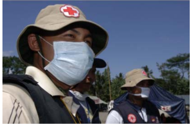
The Indonesian Red Cross has mobilized 350 field action teams (SATGANA) volunteers to assist the government in Mount Merapi evacuation and camp management of displaced people.

In water and sanitation, PMI water trucks are providing clean water to more than 2,000 internally displaced people (IDP) in Magelang and Klaten, while sanitation services are provided to 4,000 IDPs displaced by Merapi. Hygiene promotion and waste management campaigns are also being carried out in all Merapi-related IDP camps. On an overall basis, PMI/Federation water and sanitation services in the whole district of Klaten and Magelang – which includes both Merapi and earthquake displaced – cover a total of 6,400 people in various camps. Ten litre capacity bladders are located in each camp, which are filled three times a day to a total of 120 litres of water a day, supported by water supplies from the government (PDAM) and a partner national society treatment plant. Vector control activities are also carried out everyday, consisting of disinfectant sprays to minimize presence of flies and odours. 50 kg capacity waste bins are located in each camp to service waste management, which are periodically emptied by local authorities. PMI/Federation is further upgrading latrines in these camps according SPHERE standards and building additional ones to complement pre-existing latrines from the government.