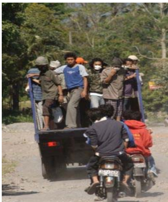
Some 20,000 people have been evacuated and are sheltering in camps across Magelang, Sleman and Klaten districts.

While Yogyakarta and the surrounding districts continue to reel from an earthquake that killed thousands and injured tens of thousands more, Mount Merapi's lava dome swelled, spurting out the heaviest cloud of ash seen to date and creating a stream of lava down its southern slopes. The increased activity followed a tectonic aftershock which experts claim did not have a direct relation to Mount Merapi (not being a volcanic quake) – some 20 kilometres south north of Yogyakarta – but may have triggered some increased volcanic activity. According to the government report from the national coordinating board for the management of disaster (BAKORNAS PB) dated 8 June 2006, the volcano emitted pyroclastic smoke rising 300 metres high and the hot cloud reached a maximum width of 5.5 km wide, causing heavy ashfall in several areas, particularly in Dukun, Srumbung, Duwur, Argomulyo, Blabak, Sawangan as well as Borobudur and its surrounding areas. This report was reinforced by the Centre for Vulcanology and Geological Hazard Mitigation which also reported increased levels of lava flows and pyroclastic clouds.