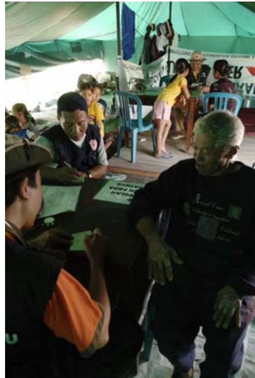
Indonesian Red Cross, with support of the Federation and partner national societies, is setting up health post and mobile medical clinic in Magelang and Klaten to attend to the health needs of the evacuees.

The local government is the key agency in providing early warning, evacuation, shelter, basic health care, water and sanitation, food and other non-food relief items, as well as human resources and transportation to carry out a successful evacuation process. An interagency disaster management team is in the field and continuing to monitor the overall operation. In the meantime, UN OCHA is carrying out coordination between government, other UN agencies, INGO and NGOs.