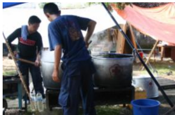
Indonesian Red Cross mobile kitchens are preparing a total of 18,000 cooked meals per day for earthquake survivors in ten different locations.

The 10 PMI field kitchens have each increased their respective capacities from 500 to 600 meals per shift (three shifts per day), and have therefore prepared a combined total of 18,000 meals a day. The primary focus for the provision of hot meals are the hospitals, field hospitals, health posts and, where possible, injured citizens residing in houses or other safe structures.