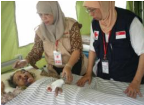
The Red Cross field hospital, set up within 48 hours of the earthquake, has provided critical medical care to over 1,100 patients.

An earthquake with a magnitude 6.3 on the Richter scale struck nearby the city of Yogyakarta in Central Java at 05:54 hrs local time on 27 May 2006. It caused extreme and widespread destruction, with consequent injuries and considerable loss of life. Its epicenter was located some 20 kms south-southeast of Yogyakarta at a depth of 10 km (see the attached map). Tremors were felt across the region, as far away as Semarang and Surabaya on the opposite coast of Java. The overall affected area covers 500 square kms and contains a population of approximately five million people.