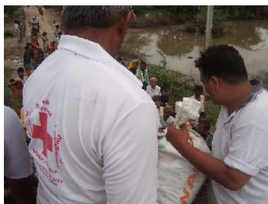
Relief items being distributed to people affected by flooding in Gujarat

The state branch has distributed 125,000 food packets and 150,000 water pouches. Apart from this, six medical camps were organized in various parts of the city where patients were treated for minor ailments and injuries. These camps were used as platforms to disseminate information to the community about waterborne diseases and the necessary precautions to be taken. Three ambulances were used for the relief operation. On an average 150-200 patients were treated in each of these camps. About 20,000 chlorine tablets have been distributed among the affected population. On the request from the state government the IRCS was involved in the collection and cremation of unclaimed bodies. This activity highlights the IRCS acting on the fundamental principle of impartiality. Despite the considerable social taboos surrounding the cremation of bodies from different castes, this did not influence the IRCS action in this regard, bringing a measure of human dignity to those who had lost their lives.