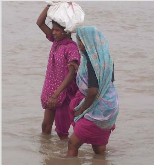
A mother and daughter stranded in flood waters in Gujarat

This DREF Bulletin is being issued based on the situation described below reflecting the information available at this time. CHF 100,000 was allocated from the Federation's Disaster Relief Emergency Fund (DREF) to respond to the needs in this operation, targeting 10,000 beneficiaries (equivalent to 2000 families) in four states. This operation is expected to be implemented over 3 months, and will be completed by November 2006; a Final Report will be made available three months after the end of the operation (by 28 February 2007). Development of this operation is reported in this update with detailed information and plan distribution as outlined below.