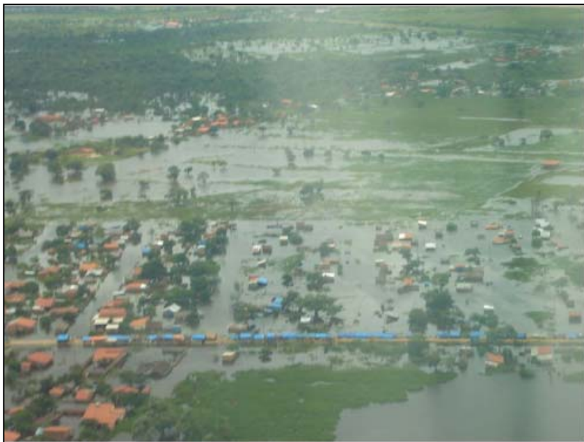
Severe flooding has left communities isolated and in need of humanitarian assistance

Bolivian health authorities have confirmed an increase in the number of cases of classic dengue from 1,320 before to 2,441 in the Departments of Beni and Santa Cruz, both severely affected by the floods. The Minister of Health confirmed that this week at risk areas would be fumigated. Dengue is carried by the Aedes Aegypti mosquito, which flourishes in areas with poor sanitation and under conditions of high precipitation. Dengue causes high fever, muscular pain, headaches, vomiting, and in some cases skin rash. Community efforts are key to preventing or reducing outbreaks of dengue.