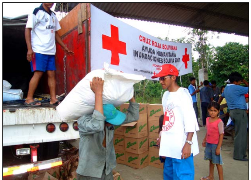
Families receiving food parcels at distributions in Cochabamba supported by BRC volunteers

The original elements of the Appeal - namely ensuring food security through the distribution of food parcels and toolkits for agricultural rehabilitation and increasing the capacity of the BRC in needs assessment and humanitarian response - will be complemented by health promotion and prevention activities against malaria/dengue and improving the BRC telecommunications system. The decision to widen activities to these areas was based on BRC assessments being carried out on the ground, which indicate an increase in the number of those affected by the floods; hence the decision to increase the number of beneficiary families to 10,000 (50,000 beneficiaries). The floods this year have shown the importance of disaster preparedness both at community level as well as institutional level within the National Society. If this Emergency Appeal is over