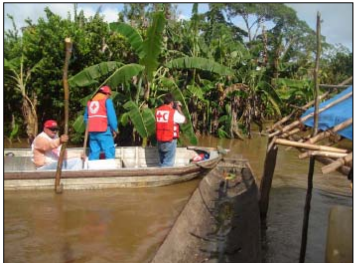
The BRC and Federation personnel are actively identifying families in need of assistance in flooded communities

As mentioned above, lack of access and long distances to the isolated rural communities in Beni (only reachable by boat and/or helicopter), and the lack of logistical resources, makes difficult to get accurate information regarding evaluation of affected families.