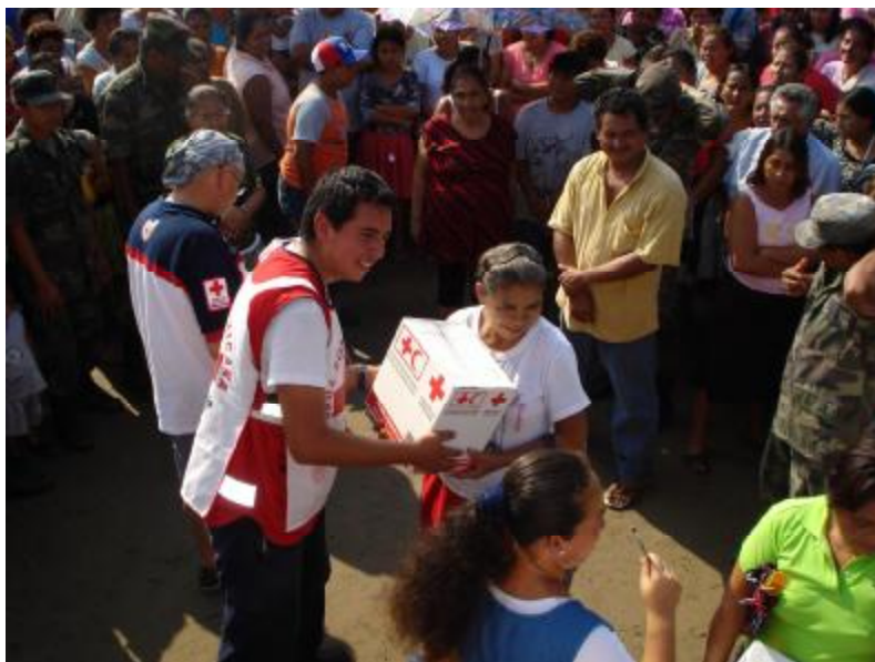
Emergency relief distributions in Villahermosa.

At present, some 6,000 volunteers are working in different areas of Mexico performing search and rescue, providing ambulatory services, medical attention and providing services in shelters. Centres for the collection of basic items for the victims of the floods are still operating opened in 485 local branches throughout Mexico. To make people aware of the shelters and where they were opened, shelter awareness campaigns have been launched by radio and television in several dialects. The shelters opened by the government are being managed by the MRC providing the people with blankets, food and general information on how to run a shelter.