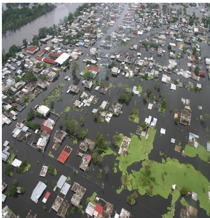
Villahermosa affected by the heavy rains.

<click here to view the attached Emergency Appeal Budget; here to link to a map of the affected area; or here to view contact details>