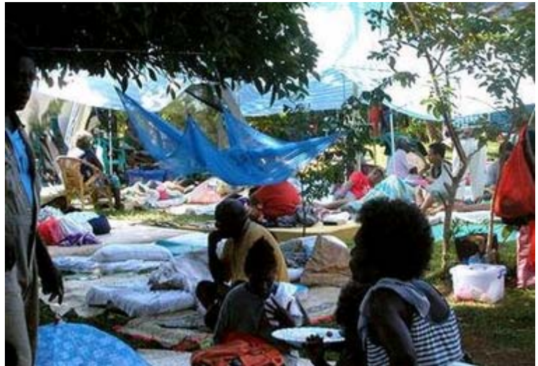
People rest in a make-shift hospital camp in the town of Gizo in the Western Province of the Solomon Islands

The relief effort by government and other agencies is severely hampered by the lack of logistics support. Boats and vehicles to transport relief and people from island to island are not enough to meet the needs. Land transport is further restricted by landslides that have cut off part of the road network.