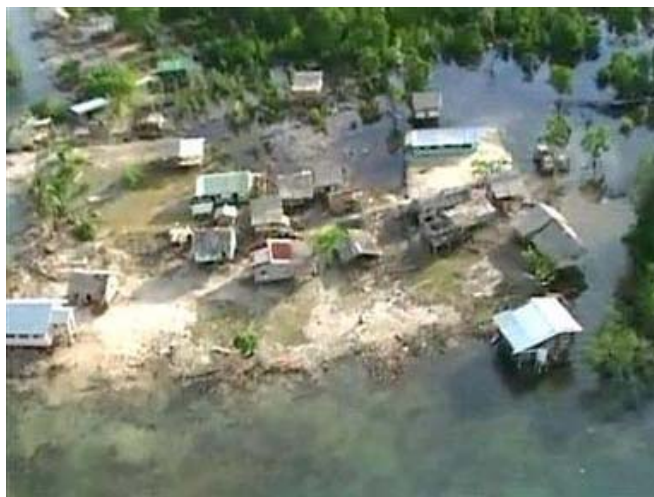
A video grab shows an aerial view of damages after a tsunami and earthquake hit the Solomon Islands

Following the 8.1 magnitude earthquake and ensuing tsunami on 2 April that struck the western provinces of Solomon Islands, 30 people are feared dead. The number of people affected varies widely, ranging from 10,000 to 50,000. Accurate information and updates remains scarce at this stage of the operation. Assessments however continue, with the Solomon Islands Red Cross Society at the centre of the relief operation and receiving support from other national societies and the Federation secretariat. A preliminary appeal was launched on 3 April; a revised plan of action and appeal is underway and will be made available shortly.