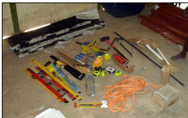
Sample of hand tools distributed to the affected communities on Vella la Vella.

The Federation has completed the shelter damage assessment on both Kolombangara and Vella La Vella, visiting over 200 communities and assessing more than 1,200 damaged dwellings (See table A). Many communities act as groups and these 'clusters' have been identified as the beneficiary groups.