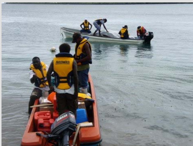
In July the first deliveries of construction tools were dispatched to the western region of Vella La Vella, the most severely affected area on the island.

Operational Summary: Led by the Solomon Islands Red Cross Society (SIRCS), Red Cross partners successfully conducted relief distribution activities, with over 37,000 items distributed to more than 1,800 families. Further to this, focus has now been redirected to shelter recovery initiatives that support government plans for permanent shelter. The provincial government has assumed responsibility for all food aid distribution and its assessment of the situation suggests that extensive food aid is no longer needed. In line with the government's development of a rehabilitation strategy for permanent housing, the Red Cross plan of action is being further revised to meet the changing needs that are being identified. The Red Cross is supporting the interim period of shelter construction by providing affected families with essential building tools, technical advice and assistance to communities in procuring local building materials. Since the last update, the appeal has received further financial support. The New Zealand government's donation of over CHF 400,000 has increased funds available significantly, and has allowed for the plan of action to be revised to further incorporate activities including water and sanitation and extended assessment works.