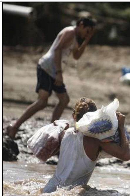
A woman crossing the river after a bridge collapsed in Honduras.

<click here to view the attached Emergency Appeal Budget; here to link to a map of the affected area; or here to view contact details>