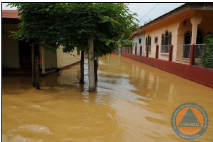
Flooded streets in Puerto Barrios.

The Ministry of Education cancelled school activities in the northern department of Cortes until the red alert is rescinded. In the western departments, including Ocotepeque and Copan, houses and schools have been destroyed and the potable water system was shut down. The Permanent Contingency Commission (COPECO) has issued a warning to the people living in the most vulnerable areas to evacuate immediately. The entire country has been affected, especially the central and western areas. Crops in the northern departments of Colon and Atlantida have sustained damage, due to the overflow of the Tocoa River. The southern department of Valle was affected, due to the rise in the Choluteca River. Moreover, several communities in the northern department of Cortes and Yoro are flooded, due to the high levels of the Ulua River.