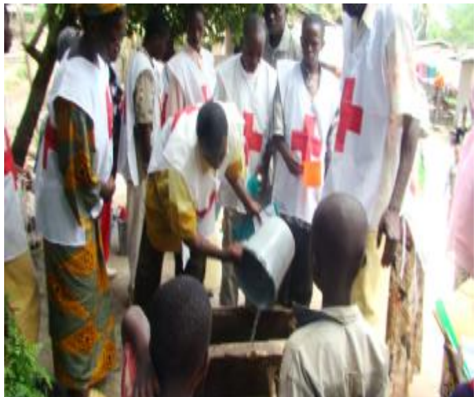
Treatment of a water point in Nola, Central African Republic

Summary: Climate predictions of especially heavy rains for the 2008 rainy season in West Africa were realized, with rainfall reaching 500 mm per day and flooding affecting river bank regions in Togo, Benin, Senegal, Gambia and Liberia. The climate forecasts now predict heavier than normal precipitation for certain zones of Central Africa for the months of October-December 2008. These heavy rains have already begun to appear, particular in the Central African Republic (CAR). This appeal therefore is being extended to support the National Society in the CAR and others in the Central Africa region to respond to flooding as additional countries are affected.