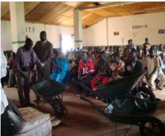
Offering of sanitation equipment to the mayor for the Prefect of Berberati