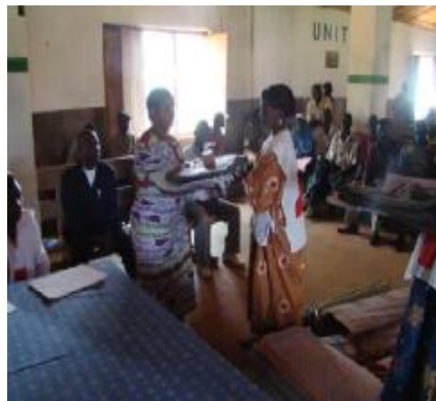
Furnishing of a kit to a head of household