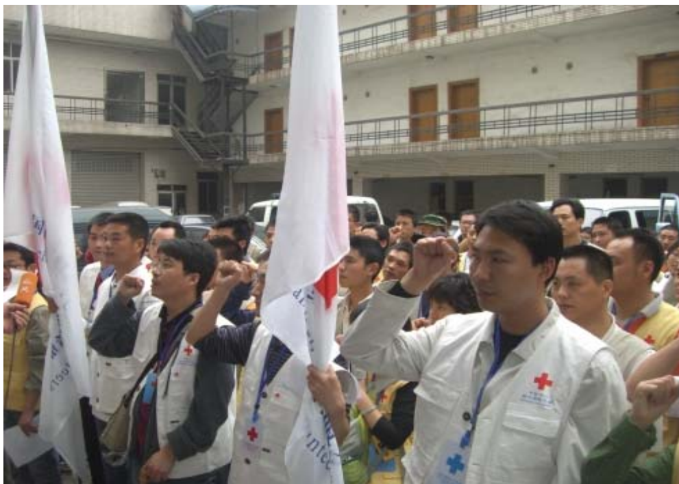
A local Red Cross volunteer team pledging their courage and determination to save those affected by the earthquake prior to their departure on 16 May to the affected areas, Chengdu, Sichuan.

Summary: The 7.8-magnitude earthquake which devastated the south-western province of Sichuan on 12 May has left 28,881 dead, 198,346 injured and 4.8 million people displaced, according to the emergency