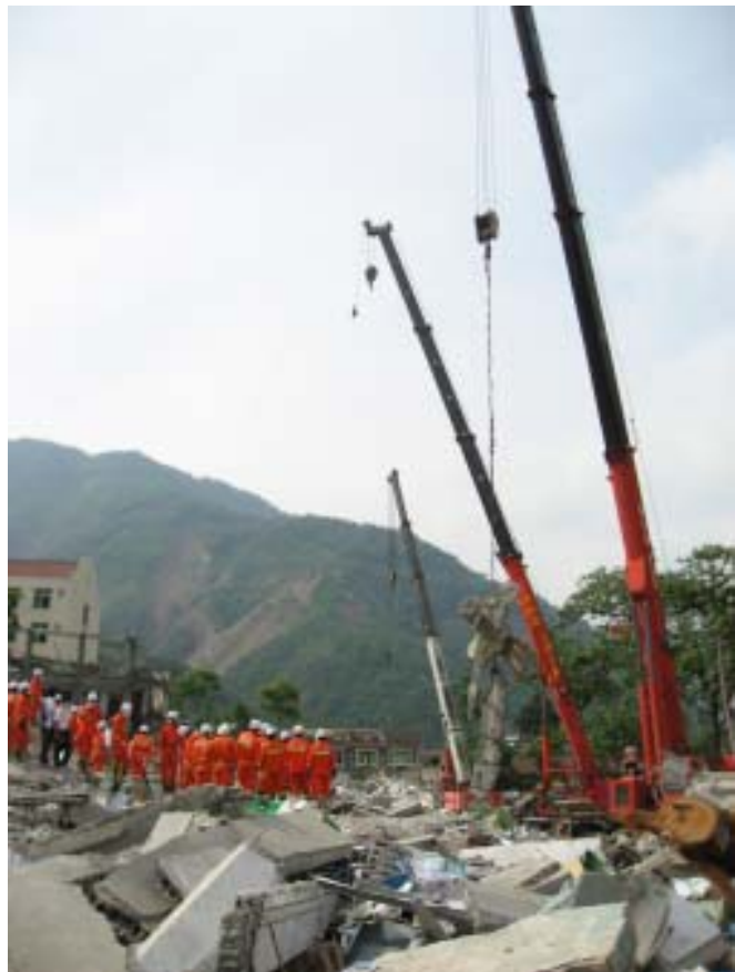
Rescue teams searching for people still buried under the rubble in Beichuan, 16 May (Red Cross Society of China, Sichuan branch).