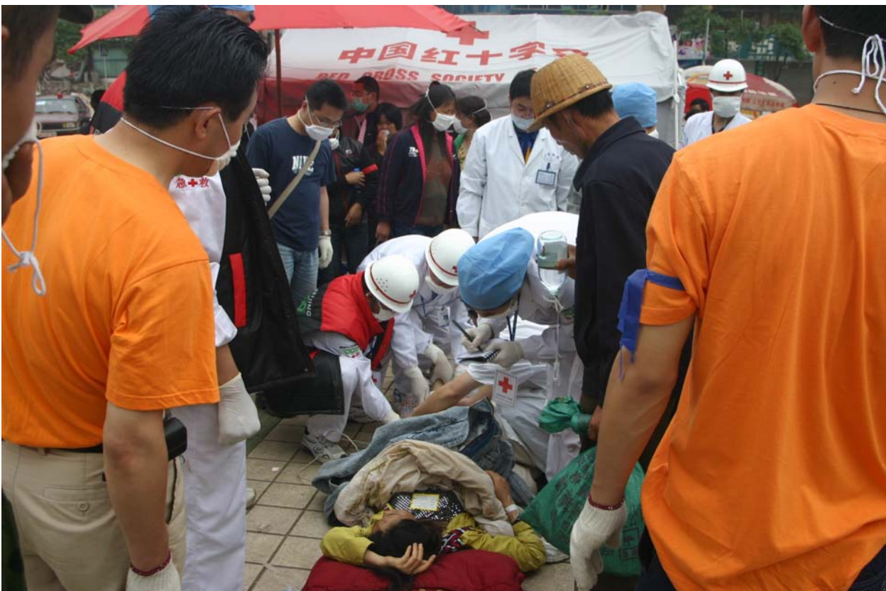
The RCSC medical team offering care to survivors: In the Sichuan province alone, over 233,000 people have been reported injured.

Landslides have been occurring due to the aftershocks, blocking roads and railways, as well as resulting in the formation of 18 lakes. According to government reports, more than 158 workers (none from the Red Cross) engaged in emergency relief have been buried by mudslides in Sichuan province. Six vehicles and two construction machines were also buried in the mud.