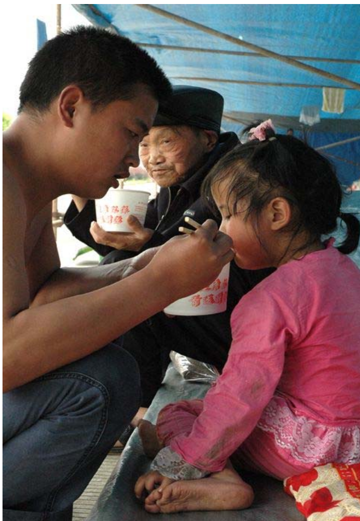
Lunchtime means instant noodles in a tent shared by members of an extended family.

Summary: As of 20 May, the death toll from the massive earthquake which struck the south-western province of Sichuan has risen to a total of 34,073 and 245,108 injured, according to the emergency response office under the State Council. Of this figure, 33,570 deaths occurred in Sichuan alone with the rest in seven other provinces and municipalities - Gansu, Shaanxi, Chongqing, Yunnan, Shanxi, Guizhou and Hubei. On 20 May, as many as 7,000 aftershocks were recorded in Sichuan. Of these 7,000, 156 were above a magnitude of four, 25 above a magnitude of five, and the largest one at 6.1. So far, 233,810 people have been injured in Sichuan alone, and an estimated 14,000 still buried under the rubble. Some 15.7 million rooms have been damaged and six million others have collapsed (respectively, approximately 5.2 million homes damaged and two million homes