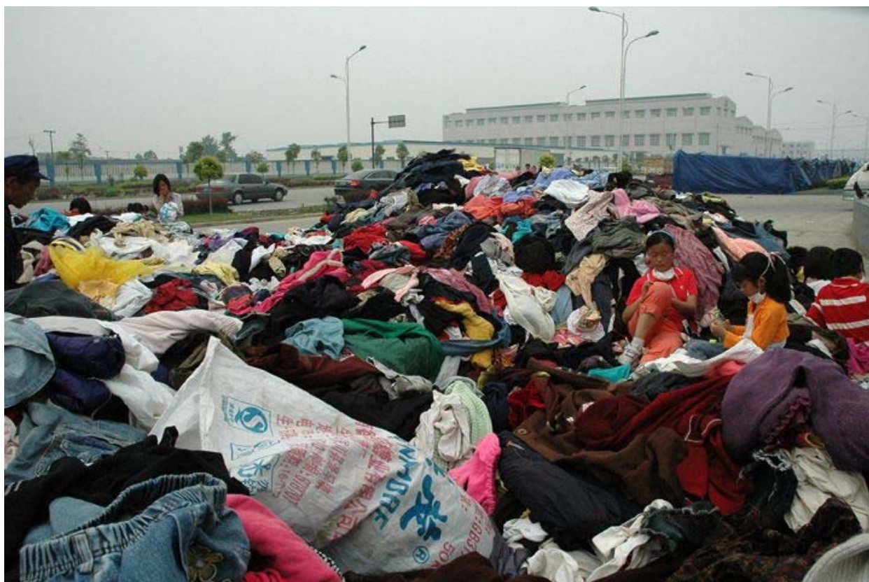
Clothing donated by people across China attracts a steady following of women looking for garments to fit their infants, after losing all their possessions in the earthquake.

On 18 May, RCSC transported milk, instant noodles, drinking water, quilts, torches, raincoats, tents and clothes from its Xi'an warehouse to Sichuan. Meanwhile, more relief items from warehouses in Shanghai, Guangdong, and Yunnan have been mobilized to affected areas in Sichuan, Chongqing, Gansu, Shaanxi, Yunnan and Guizhou provinces. The same day, a batch of in-kind relief items donated from the logistics centre of the Chinese Army to RCSC was transported directly to Sichuan. This batch consisted of cooking units, medical equipment, tents, water purification equipment and generators worth CNY 15 million (CHF 2.3 million). On 19 May, the fourth batch of relief items from RCSC headquarters left Beijing for Chengdu. This batch included ten ambulances, 1,600 heavy duty gloves, 2,400 masks, winter clothes, tents, food and medicines. The items will arrive on 21 May.