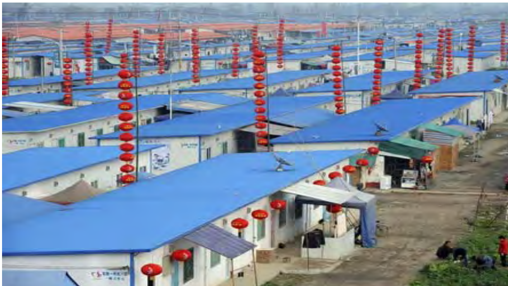
Lanterns ushering in the Chinese Lunar New Year of the Ox, which begins on 26 January, are hung at a temporary housing area for those who lost their homes in the 12 May earthquake in Mianzhu, Sichuan province.