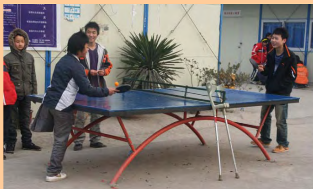
A boy who lost his leg to the earthquake plays ping pong with friends at a temporary prefabricated school. Many others like him will be able to improve their physical well-being if prosthesis and physical rehabilitation are available to them.