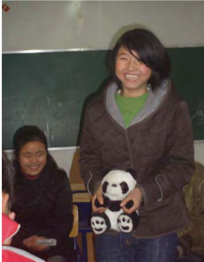
A schoolgirl relating a story through the eyes of Qiu Qiu the panda as part of the International Federation's psychosocial support programme which was tested during a trial run at a school in Shifang, Deyang.

Thousands of factories have been shut down due to the falling global demand for Chinese-made products and many more businesses have also had to close. Increasing job losses have led to around 20 million migrant workers, or 15.4 per cent of the mainland's 130 million migrant workers, being forced to return to the countryside. Officials predict more job losses and estimate the number to reach 25 million this year.