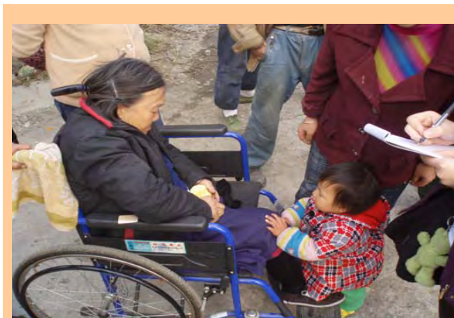
In Shuangguan village, Zundao township, this 68-year-old resident who was made a widow and also lost her leg to the earthquake, is unable to afford medical and rehabilitation costs since free medical services were halted after 1 January 2009. Through coordination with other NGOs, the International Federation has helped her continue to receive medical care and rehabilitation.

The International Federation and RCSC have been busy providing support to schools and communities to overcome trauma through the promotion of a better understanding about the International Federation's psychosocial support programme.