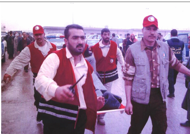
Iraqi Red Crescent volunteers on scene, in order to deliver critical humanitarian services to the most vulnerable in Iraq

Related to the public health in emergencies objective, focus will be given to community based first aid (CBFA) and the school first aid programme. These activities will be complemented by the establishment of mobile medical units (MMUs) and the strengthening of the psycho-social support programme (PSP).