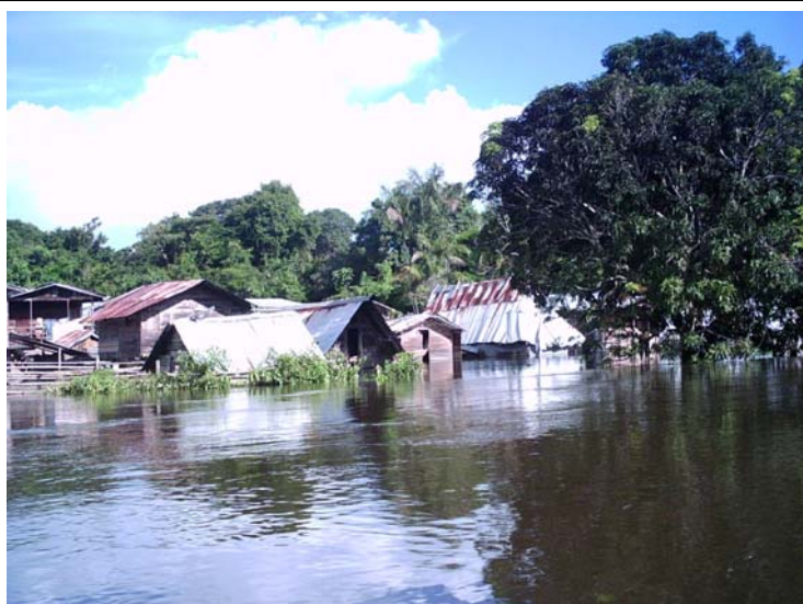
South Eastern Suriname flooded.

The Pan American Health Organization (PAHO) is coordinating with the NCCR as well as with the Suriname Red Cross to assist with the provision of chlorine tablets. Other international organizations are also providing support to the response, such as UNICEF.