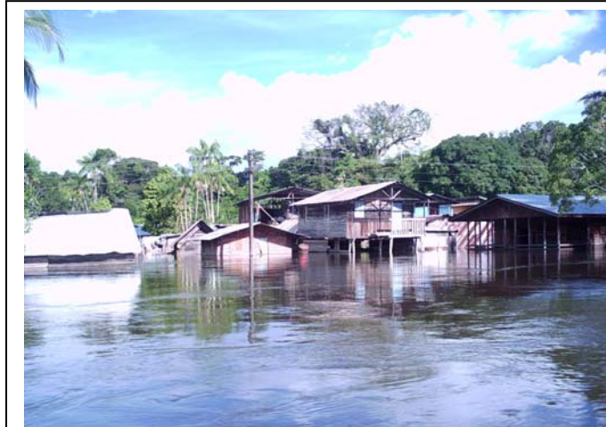
South Eastern Suriname flooded.

On 16 June - two weeks after the flooding started - reports indicated that the flood water had receded in most parts. However, some areas remain flooded, which makes life increasingly difficult for the population of those areas. In addition, there continues to be sporadic rainfall in the region with heavy rainfall expected in the near future. The government has started to carry out damage and needs assessments of the affected areas and is