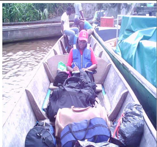
Red Cross Volunteer Completing Assessment in South Eastern Suriname.

<click here to view the attached Emergency Appeal Budget; here to link to a map of the affected area; or here to view contact details>