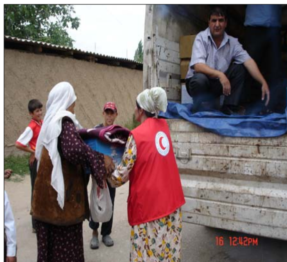
Distribution of non-food items by the RCST volunteers.

The distribution of seeds, fertilizers and food had been successfully completed by mid April and targeted 1,547 female-headed households (4,641 beneficiaries) in Rudaki and Vahdat districts of DRD. Each household received onion seeds (250 gm), potato (36 kg), carrots (150 gm) beans (2 kg), sodium nitrate (10 kg), carbomide (10 kg). In general, 154.7 hectares of farmlands have been cultivated with potato, carrot, onion and beans.