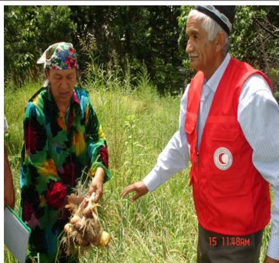
Red Crescent volunteers monitored yielding of the beneficiary families to see the impact of the operation.

Summary: The initial DREF operation was extended to an emergency appeal operation to include the distribution of basic relief non-food items to female-headed families with children under 15 years of age (1,547 households) and elderly people (456) living alone in Rudaky and Vahdat districts. The planned activities were successfully completed; each beneficiary received a food package containing wheat flour, sunflower oil and beans to supplement the food they had in the stock and help sustain them through the planting phase of cultivating next season's crop.