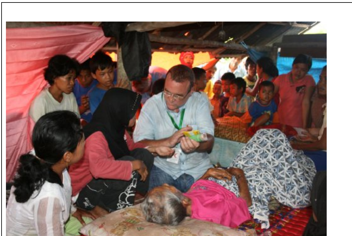
An Indonesia Red Cross (Palang Merah Indonesia/PMI) volunteer is gathering information from a survivor in a village in Padang Pariaman district while an International Federation staff looks on.